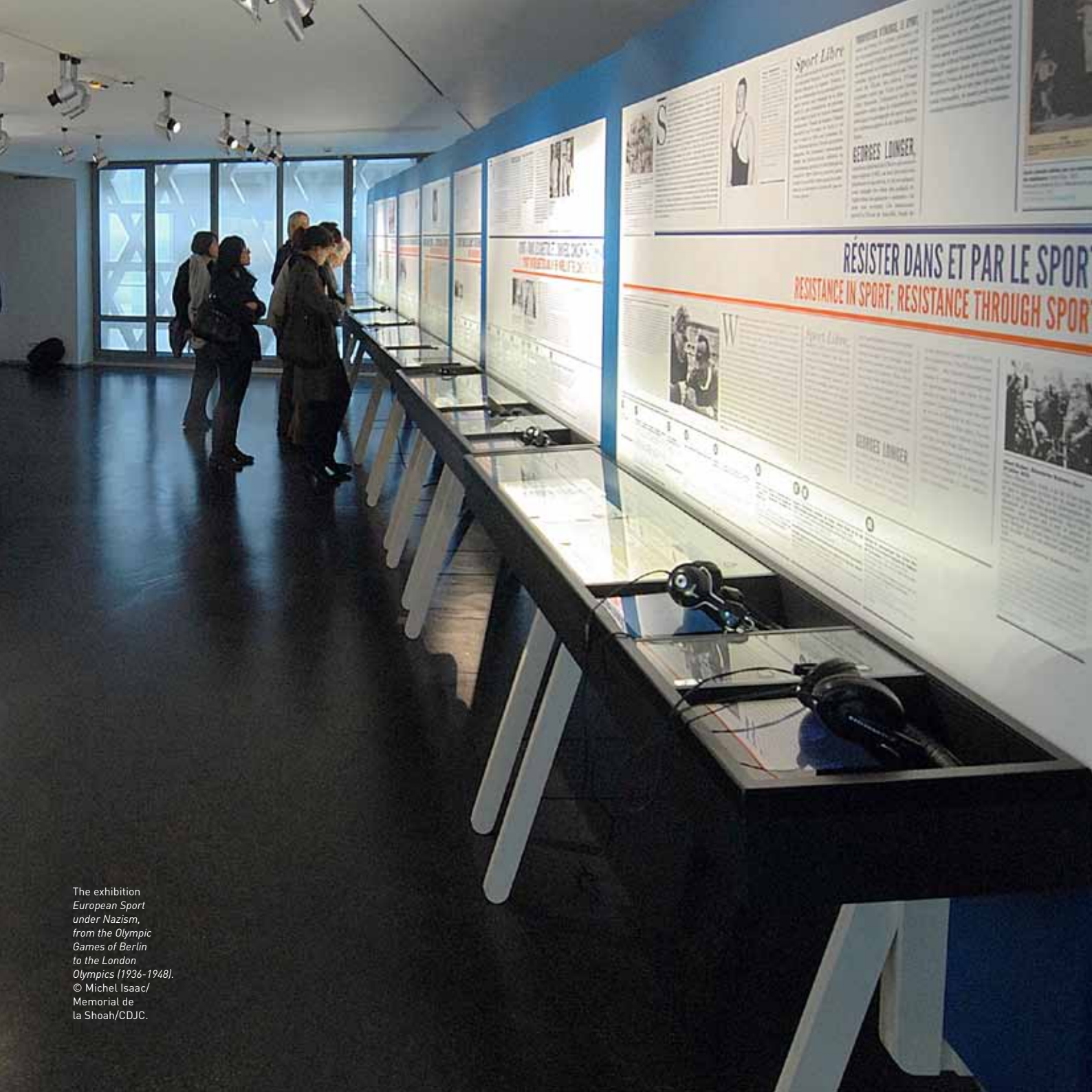
The exhibition European Sport under Nazism, from the Olympic Games of Berlin to the London Olympics (1936-1948).