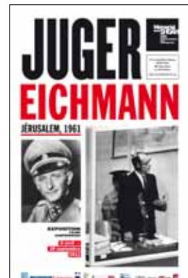
Eichmann on trial, Jerusalem 1961 8th April - 28th September 2011