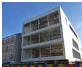
Left page, above: The construction site of the future Memorial at Drancy, which shall open to the public in the course of 2012. © Shoah Memorial/CDJC.

Right page: The Shoah in Europe presented by the Shoah Memorial, in its Italian version, at the Palazzo dell'Archiginnasio (Italy) for the commemoration of the 27th of January, in partnership with the region Emilia-Romagna © All rights reserved. With the kind authorization of the Emilia-Romagna region.