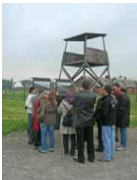
At the Memorial, Italian professors were able to further their knowledge on the Shoah and exchange questions on teaching methods.