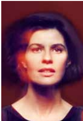
Above: Killing Kasztner film poster by Gaylen Ross.