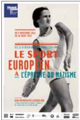
European Sport under Nazism 9th November 2011 - 29th April 2012