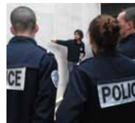
Training for new police recruits now also includes a seminar at the Shoah Memorial.

Finally, training courses for carers and educators working in contact with people who lived through the Shoah continued in 2011.