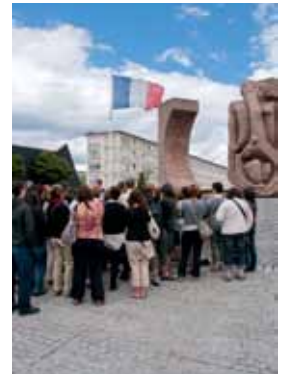
During the summer university session in Paris teachers visit the Drancy camp, the main internment and transit camp for Jews of France from 1941 to 1945.

The second took place from the 18th to the 25th of August. Participants visited the principal places of Jewish culture in Poland, as well as the extermination sites implemented by the nazis. They also met historians, teachers, and members of the Jewish community.