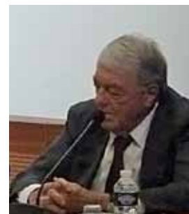
Serge Klarsfeld, lawyer and historian (above), Claude Lanzmann, filmmaker and historian (below), as part of the event "Views on the Eichmann trial".