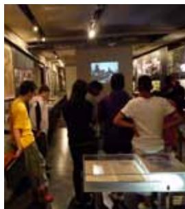
Left page: All year round general or thematic guided visits are proposed to middle and secondary schools classes.