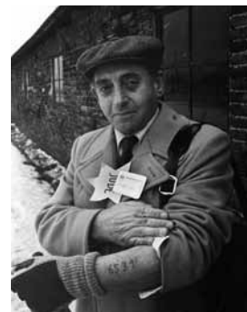
Above: a document made out of 26 original photographs dating from post-war Poland and which were given.