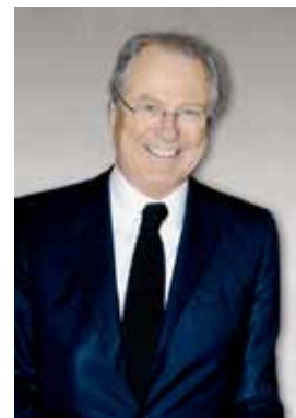
Éric de Rothschild.

Éric de Rothschild, President of the Shoah Memorial.