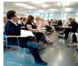
About 100 teachers attended the University courses proposed by the Shoah Memorial in 2012. Here, a seminar taking place during the Parisian Summer University session.