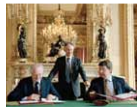
Above: the Maison Française of Washington welcomed during a week the American version of the exhibition on Hélène Berr.