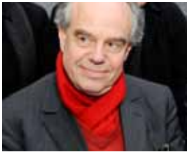
Left page: Above: Yossi Gal, ambassador of the State of Israel in France, during the 69th anniversary of the Warsaw Ghetto Uprising.