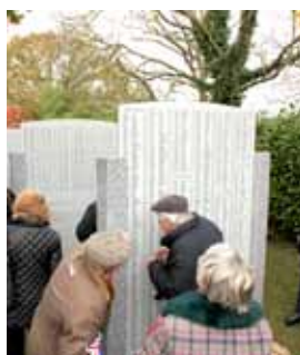
Above: Memorial for the Milles Camp, near Aix-en-Provence. It offers three different itineraries: historical, memory-based and reflexive. The Memorial supported the making of the first two parts.