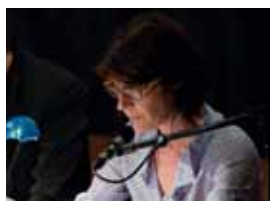
Left page: During an evening at the auditorium of the Memorial, 11 June, 2012, the actor Jérôme Kircher and the actress Irène Jacob read some texts which were written by children.