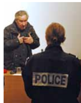
Above: Robert Badinter, lawyer and former Minister, during the colloquium for the lawyers from the Paris Bar.