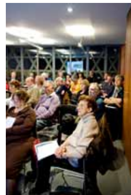
The workshop “Archives and genealogy” introduces to genealogical research, method and sources.

Finally, 9 memory journeys were organized by the Memorial – one of which was an exceptional trip taking place from October 28 - November 1 2012 – within