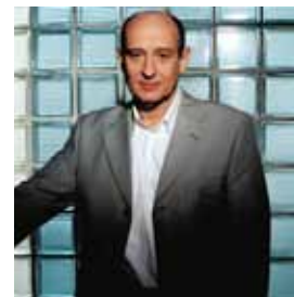
Michel Jonasz came to read some texts written by writer Sholem Aleikhem, at an evening organized during the Jewish culture festival.

The public discovered the 2012 current literary scene thanks to about thirty meetings. For instance, the publication of Sholem Aleikhem's work called La Vie éternelle, 13 histoires courtes pour marquer le temps in its French translation was the opportunity of a reading by the comedian Michel Jonasz (160 people). As for the start of the literary season, it was celebrated in the Memorial with the coming of more than ten authors.