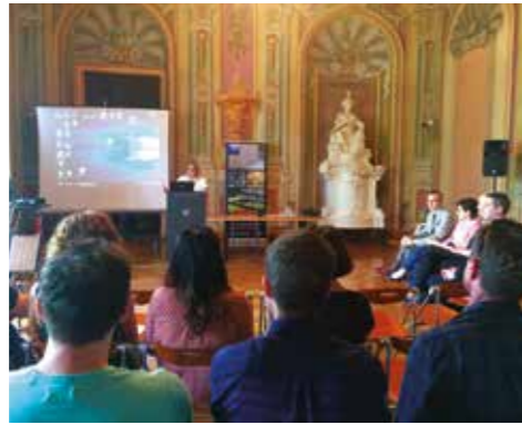
Skopje, 2017.