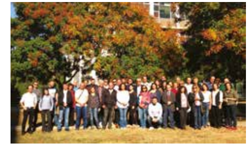
Thessaloniki, 2017.

Over the years, they allowed for sustained dialogue and rapprochement between these neighbouring countries with memory divides.