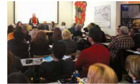
Belgrade, 2019.